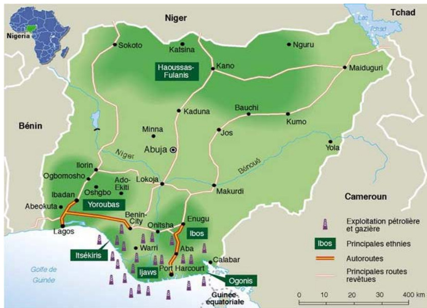
Figure 2.2 Map of Nigeria showing areas of oil exploration in Niger Delta States

Below is a map of Nigeria showing major areas of oil exploration and exploitation in the Niger Delta region.